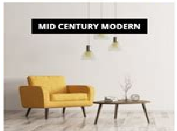
MID CENTURY MODERN