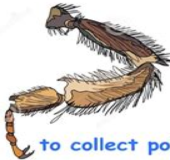
to collect pollen