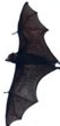
Black Flying Fox