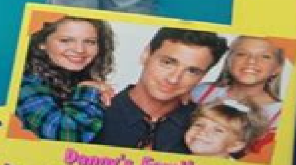
Danny's Family Danny, D.J., Stephanie and Michelle

WARNING: Contains small parts which pose a hazard for children under the age of three.