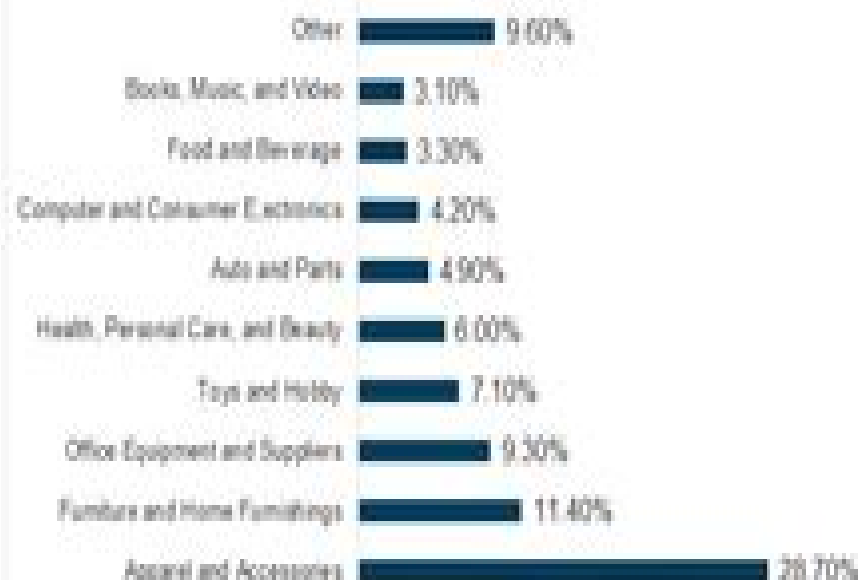
US Retail Sales Growth, By Category, 2021, % Change