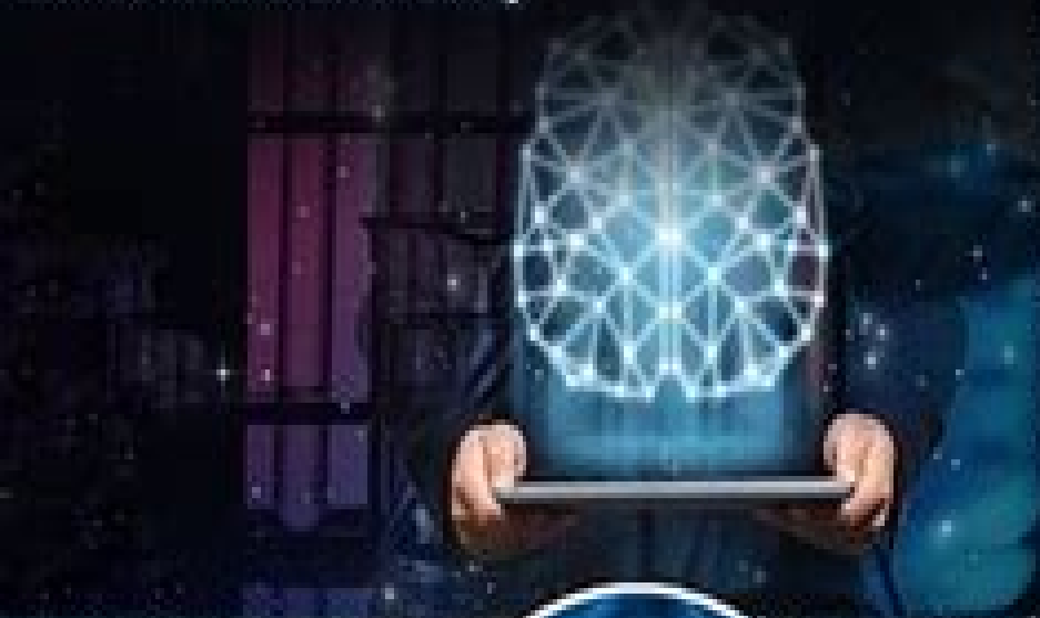
Freezing the brain