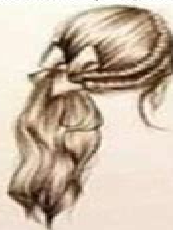
Side braid ponytail