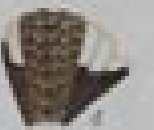
Head with black and white stripes on the sides of the head.