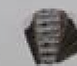
Head with black and white stripes on the sides of the head.