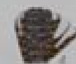
Head with black and white stripes on the sides of the head.