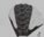
Head with black and white stripes on the sides of the head.