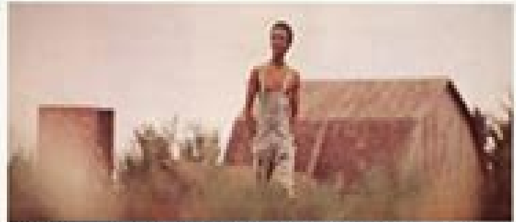
It's the place where you come to learn what life is all about. By the time you see it, you'll know that's exactly what it is.