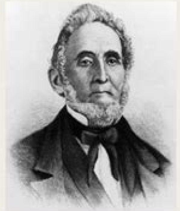
and Sidney Rigdon