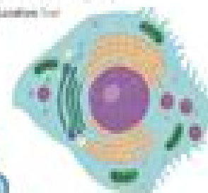
Size of mitochondrion

Liver cell Scientific name: hepatocyte Location: liver