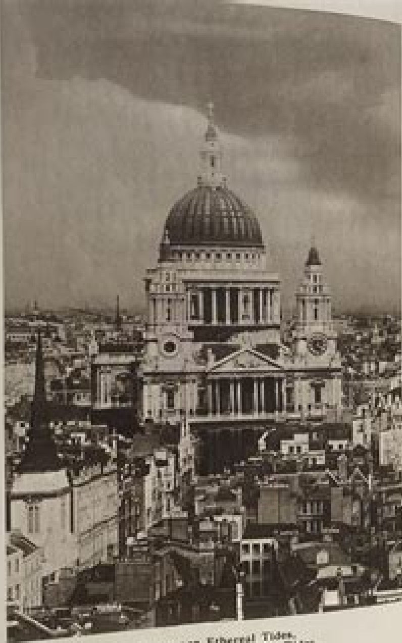
Afloat upon Ethereal Tides, St. Paul's above the City Rides

Heart of the Empire and Wonder of the World