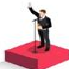
The Debater ENTP Personality 'Eyes on the prize' kind