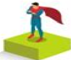
The Defender ISFJ Personality Humble soul