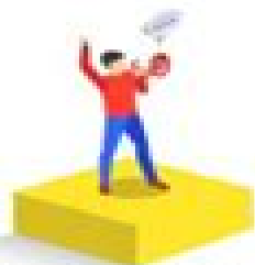
The Campaigner ENFP Personality Careless talented kind