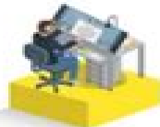
The Architect INTJ Personality Brilliant brain