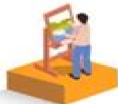
The Adventurer ISFP Personality Artist