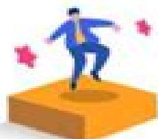
The Mediator INFP Personality Free soul