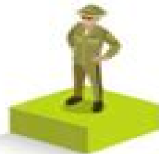
The Commander ENTJ Personality Relentless type