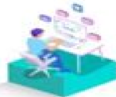
The Logician INTP Personality Crazy techie type