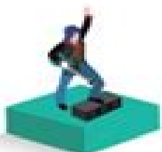
The Entertainer ESFP Personality Fancy kind