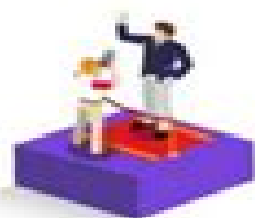
The Consul ESFJ Personality Popular kind