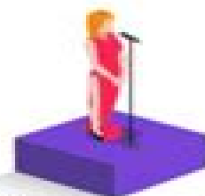
The Protagonist ENFJ Personality Righteous spokesperson