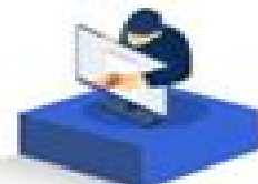
The Virtuoso ISTP Personality Hacker