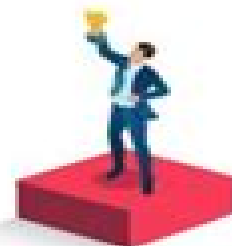
The Executive ESTJ Personality Favourite of all