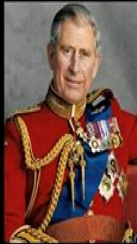
King Henry VIII Queen Victoria Queen Elizabeth King Charles III