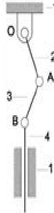
Punch Kinematic Diagram