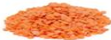
30g lentils (dry) 8g fibre