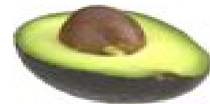
60g avocado 4g fibre