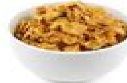
30g bran flakes 5g fibre