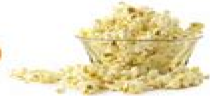
30g popcorn 4g fibre