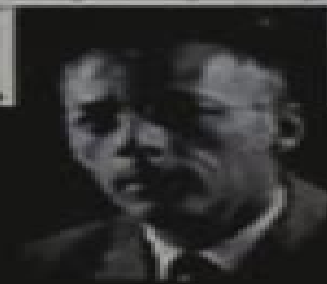
Jay W. Forrester