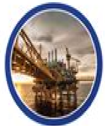
Oil & Gas