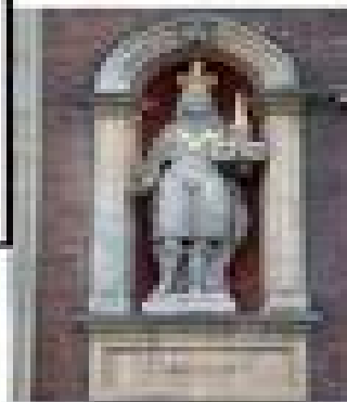
King Charles I Statue, City Hall, Worcester, England, UK