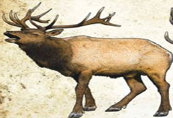
TULE ELK ( Cervus canadensis nannodes ) Range: Central California Conservation status: Vulnerable