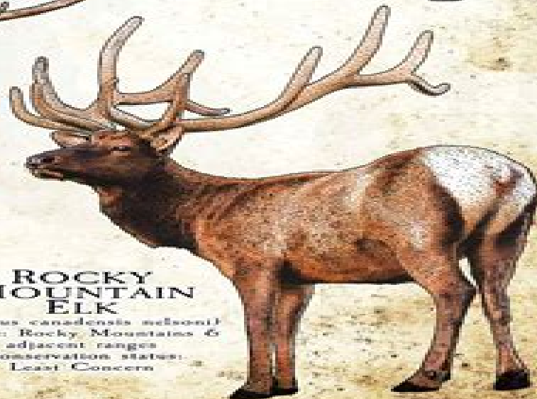
ROCKY MOUNTAIN ELK ( Cervus canadensis nelsoni ) Range: Rocky Mountains & adjacent ranges Conservation status: Least Concern