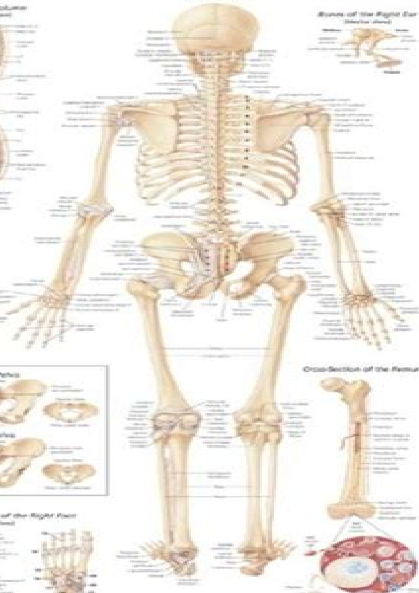
Bones of the Right Ear (Superior View)