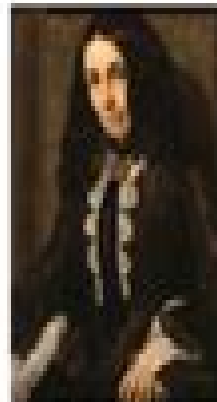
Elizabeth Barrett Browning