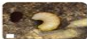
Larva (Bee Larva)