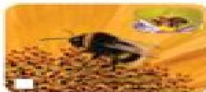
Bee (Bumble, honey, Worker)