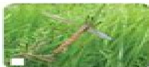
Crane flies (Daddy Longlegs)