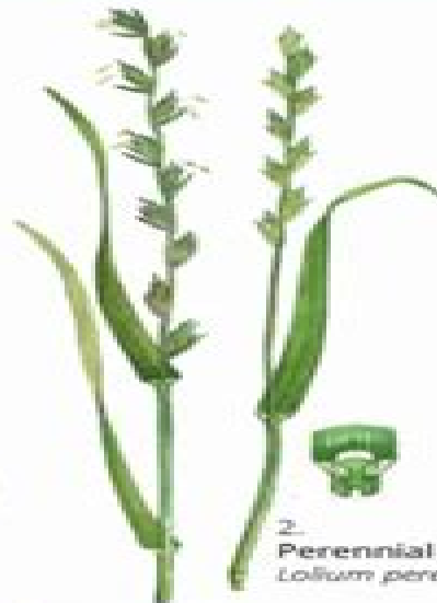
2. Perennial Rye-grass Lolium perenne ●