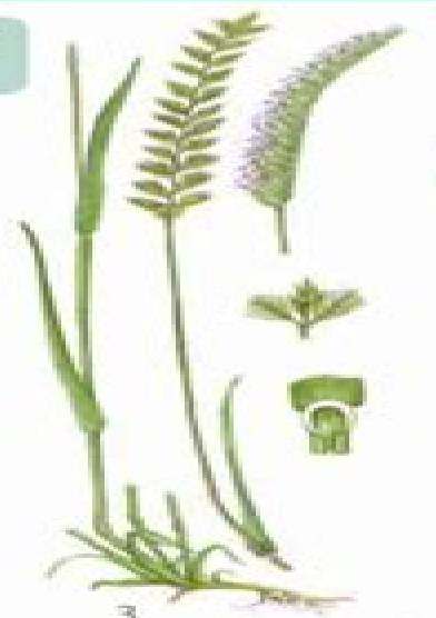
3. Crested Dog's-tail Cynosurus cristatus ●