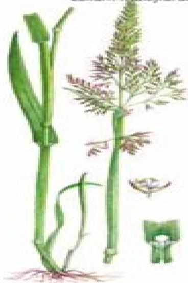
5. Yorkshire Fog Holcus lanatus