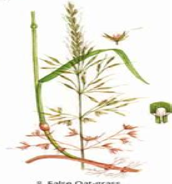
8. False Oat-grass Arrhenatherum elatius