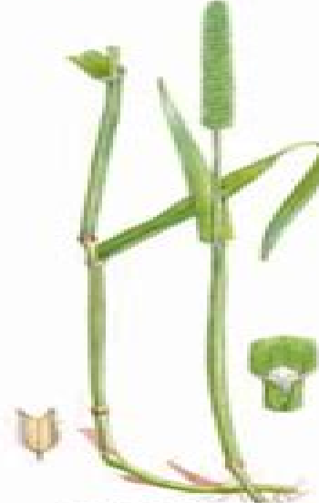
7. Timothy Phleum pratense ●