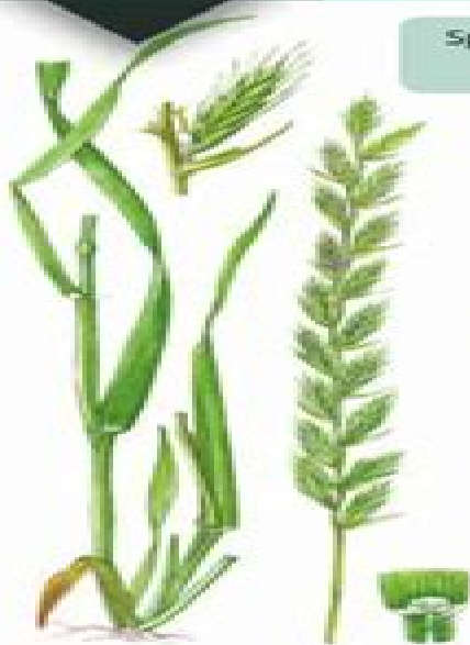
1. Italian Rye-grass Lolium multiflorum

Species marked ● are often found in playing fields and lawns.