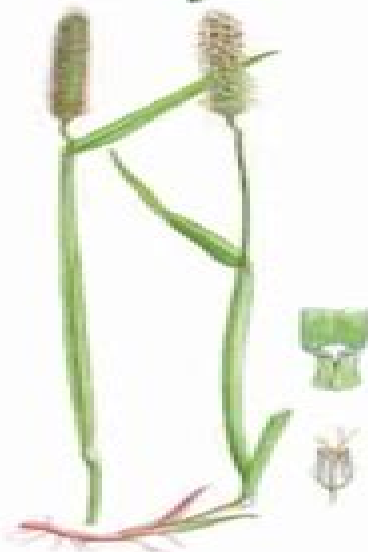
6. Meadow Foxtail Alopecurus pratensis