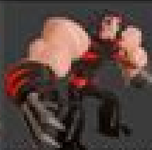
03 WEAPON 9 APOCALYPSE