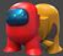
01 AMONG US