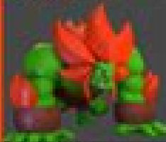
02 BLAND A