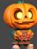
05 C. CARRASCO