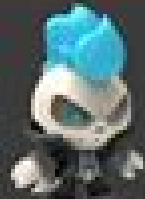
02 BLUE GHOST RIDER