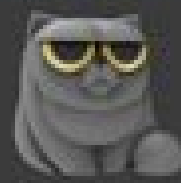
04 GRUMPY CAT