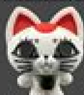
09 TURBO GRUMPY