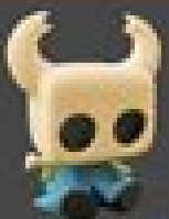
07 HOLLOW KNIGHT