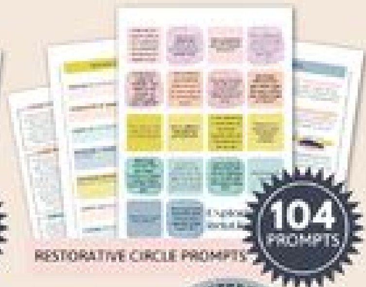
RESTORATIVE CIRCLE PROMPTS