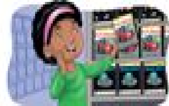
2. Find the video games.