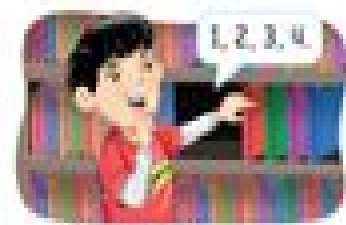
4. Count the books.