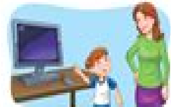
1. Point to the computer.