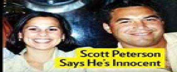
Scott Peterson Says He's Innocent