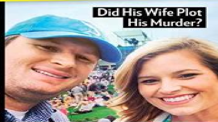
Did His Wife Plot His Murder?