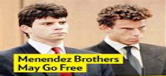
Menendez Brothers May Go Free