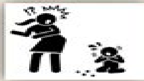
Choking / suffocation