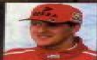
Michael Schumacher FERRARI