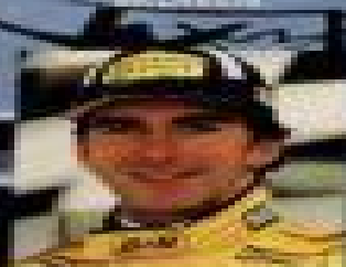
Damon Hill JORDAN