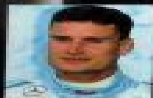
David Coulthard McLAREN