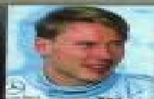
Mika Häkkinen McLAREN