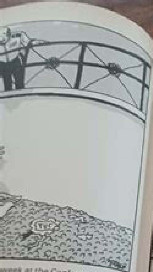
week at the Conference"