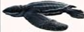
Leatherback Sea Turtle