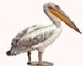
Great White Pelican