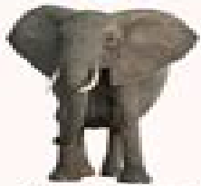
African Bush Elephant