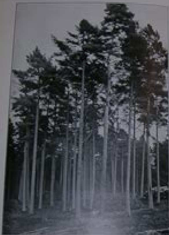
PORTLAND, Maine. Spruce forest, 1890.