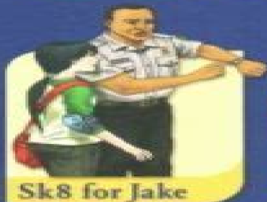
Sk8 for Jake