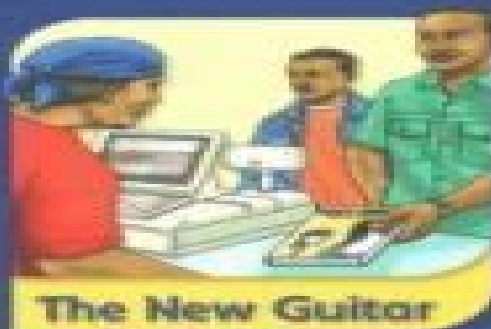
The New Guitior