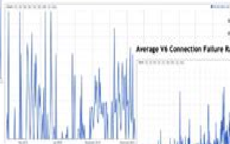
Average V6 Connection Failure Rate for China (CN)