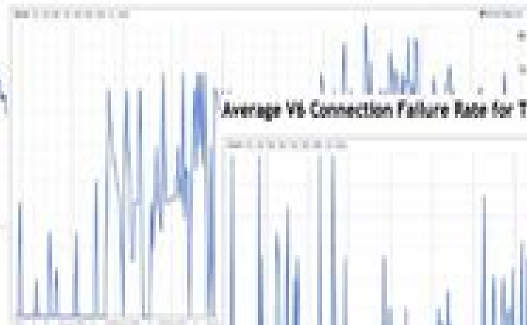
Average V6 Connection Failure Rate for Turkey (TR)