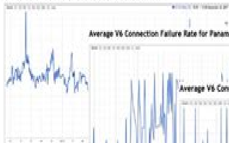
Average V6 Connection Failure Rate for Panama (PA)