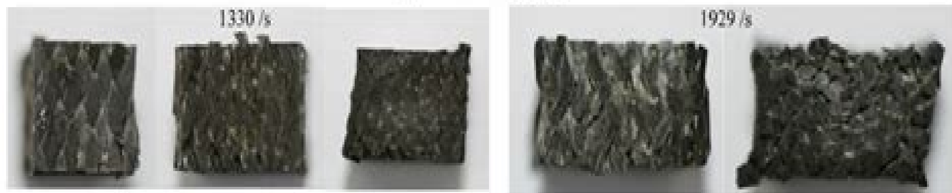
(b) 30° braiding angle