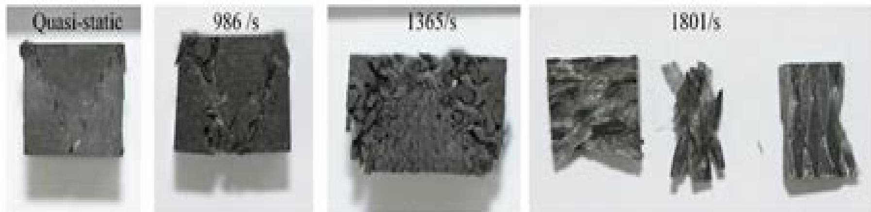
(a) 20° braiding angle