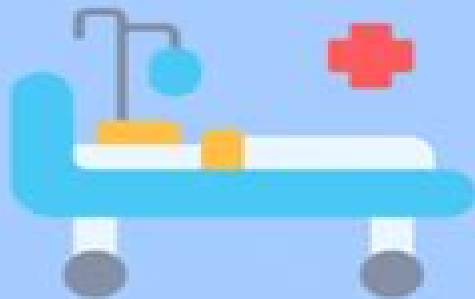
Patient care policies