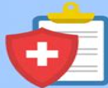
Health & Safety policies