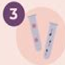
3 Egg and Sperm Preparation