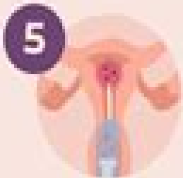
5 Embryo Transfer