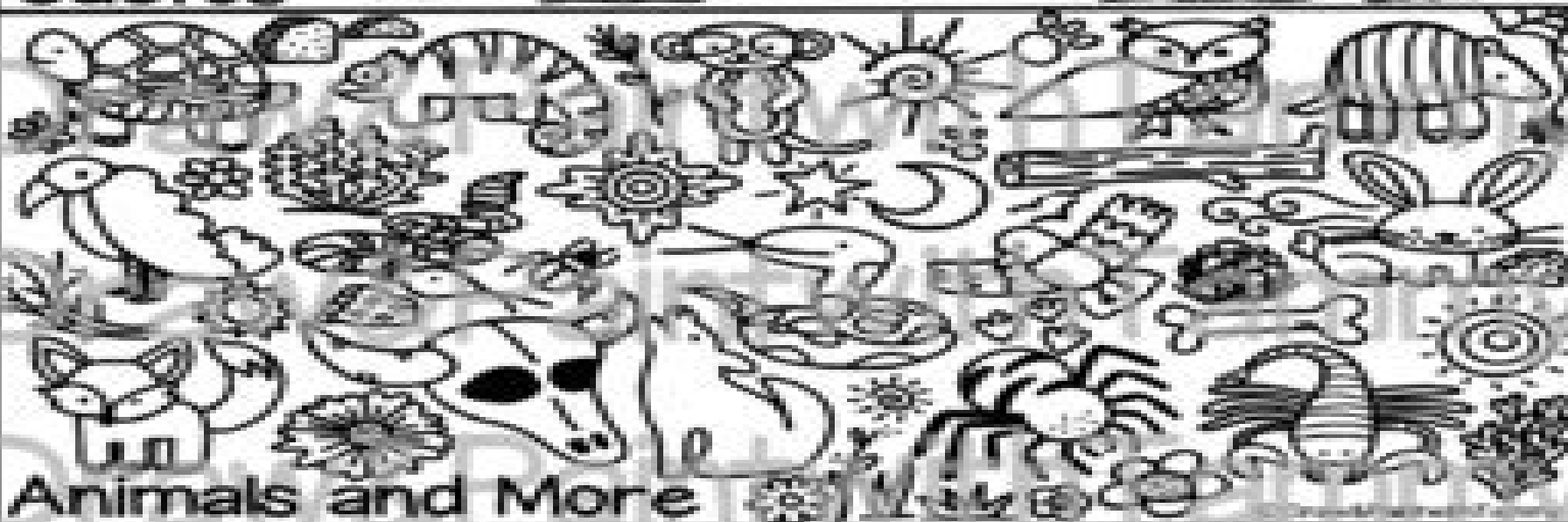
Animals and More