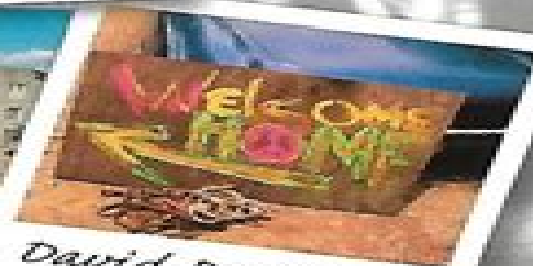
David B. Sentelle