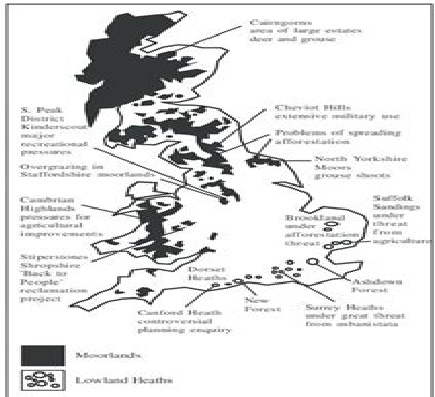
Fig 2. Distribution of Heathlands in Great Britain

However whilst it is possible to distinguish between lowland heaths and upland heather moorlands and they form two very distinctive ecosystems (see Figs 3a and 3b overleaf) they do have many common features (see p3).