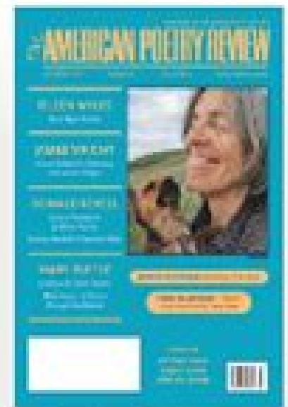
American Poetry Review