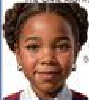
Ruby Bridges: Born on September 8, 1954

SHE WAS THE FIRST AFRICAN-AMERICAN CHILD TO DESEGREGATE AN ALL-WHITE ELEMENTARY SCHOOL IN THE SOUTH. BRIDGES' ENROLLMENT IN THE WILLIAM FRANTZ ELEMENTARY SCHOOL IN NEW ORLEANS IN 1960 MARKED A SIGNIFICANT MILESTONE IN THE CIVIL RIGHTS MOVEMENT.