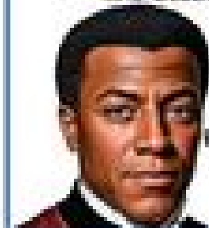
Benjamin Banneker: Born on November 9, 1731

HE WAS A FREE AFRICAN-AMERICAN ASTRONOMER, MATHEMATICIAN, AND SURVEYOR. BANNER IS KNOWN FOR ASSISTING IN THE SURVEYING OF WASHINGTON, D.C., AND FOR PUBLISHING SEVERAL ALMANACS CONTAINING HIS CALCULATIONS AND OBSERVATIONS.