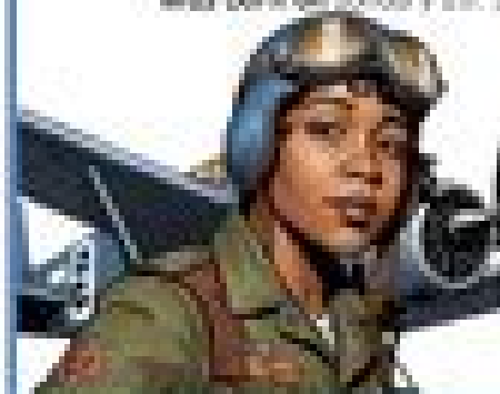
Bessie Coleman: Was born on January 26, 1892

SHE WAS THE FIRST AFRICAN-AMERICAN WOMAN TO HOLD A PILOT'S LICENSE. COLEMAN OVERCAME RACIAL AND GENDER BARRIERS IN AVIATION DURING THE EARLY 20TH CENTURY AND BECAME A CELEBRATED FIGURE IN THE FIELD OF AVIATION.