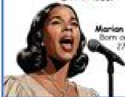
Marian Anderson: Born on February 27, 1897

SHE WAS AN AFRICAN-AMERICAN CONTRALTO AND ONE OF THE MOST CELEBRATED SINGERS OF THE 20TH CENTURY. SHE BROKE RACIAL BARRIERS BY BECOMING THE FIRST AFRICAN-AMERICAN TO PERFORM AT THE METROPOLITAN OPERA IN NEW YORK CITY IN 1955.