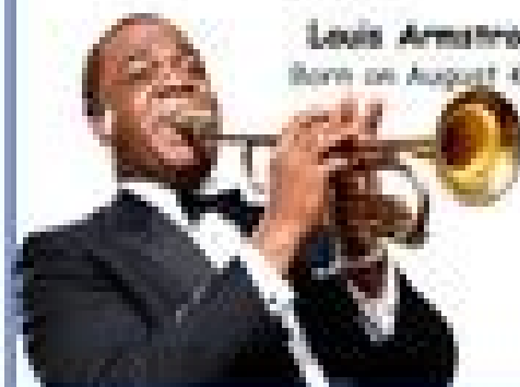
Louis Armstrong: Born on August 4, 1900

HE WAS A JAZZ TRUMPETER, COMPOSER, AND SINGER. ARMSTRONG WAS A FOUNDATIONAL INFLUENCE IN JAZZ AND POPULAR MUSIC, KNOWN FOR HIS DISTINCTIVE VOICE AND IMPROVISATIONAL SKILLS.