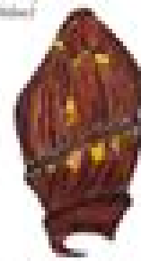
Gilled Snail (Gastropoda: Planorbidae) 4-10mm