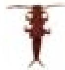
Rocklike Stonefly (Plecoptera: Perlodidae) 4-10mm