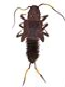
Giant Stonefly (Plecoptera: Perlodidae) 20-30mm