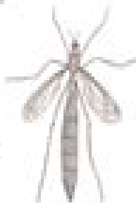
Cressfly Adult (Diptera: Tipulidae) 10-20mm