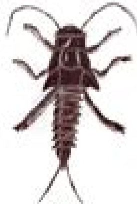
Giant Stonefly (Plecoptera: Perlodidae) 20-30mm