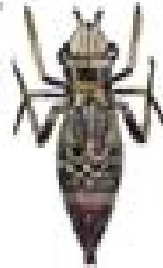
Dragonfly Larva (Zygoptera: Libellulidae) 20-30mm