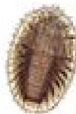
Water Penny Beetle (Zygoptera: Psephenidae) 1-2mm