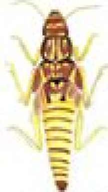
Common Stonefly (Plecoptera: Perlodidae) 10-20mm