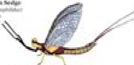
The "Blow" Fly (Mayfly Doe) (Ephemeroptera: Ephemerellidae) 10-20mm