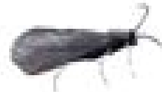
Little Black Caddisfly (Trichoptera: Hydropsychidae) 2-10mm