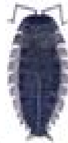
Aquatic New Bug (Dermaptera: Notostomatidae) 1-2mm