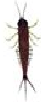
Brashlegged Mayfly (Ephemeroptera: Baetidae) 4-10mm