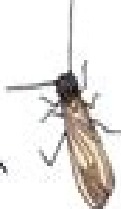
Noddy (Yellow Stonefly) (Plecoptera: Chloroperlidae) 2-10mm