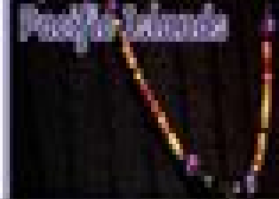
Africa, Asia and the Pacific Islands