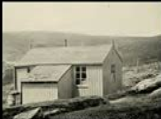
NICOLAS KIDRICOMBE'S HOUSE FROM THE RIVER