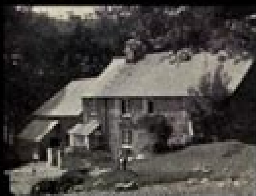
RUDDYFORD FROM THE WHIRLWIND