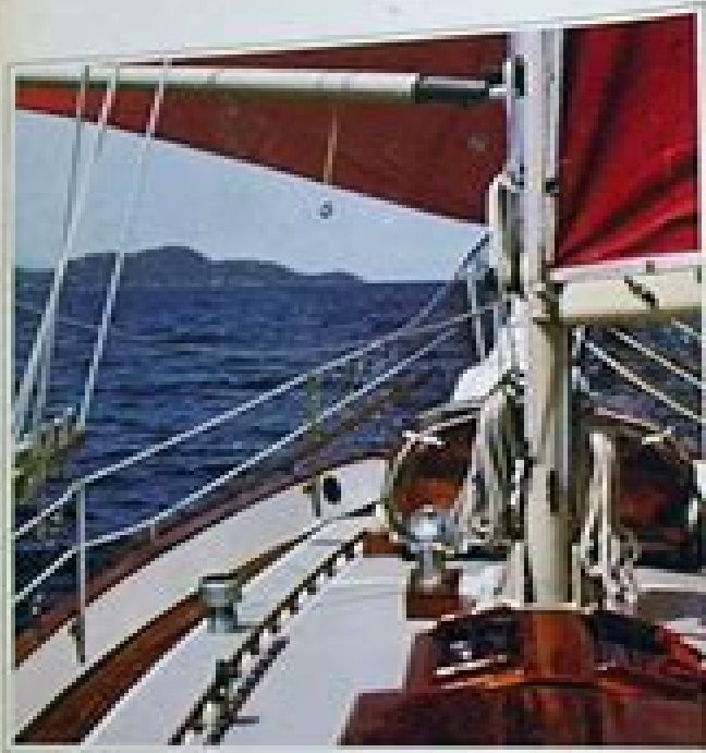
VOLUME II EXTERIOR

"A practical and wonderful work... If you own a boat of any kind, or you're just dreaming of one, you must read The Finely Fitted Yacht." CANADIAN YACHTING