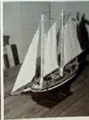
Fig. 4.17 American pinkie, a schooner-rigged model of the Eagle 1820

larger pinkies turned to privateering. Some were very big at around thirty tons, but many of the smaller ones of five to six tons were home built. The pink plans of these craft varied considerably depending on the job for which they were used.