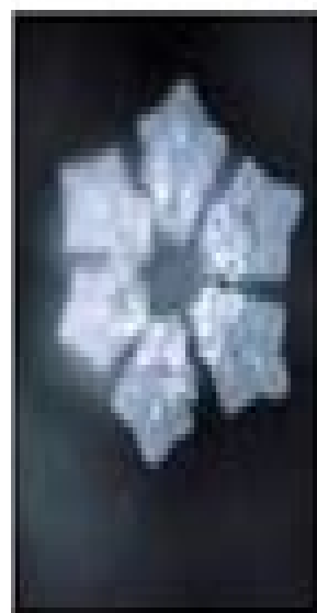
Imagine by John Lennon