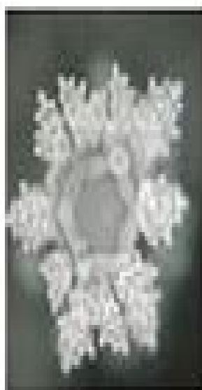
Shown a photo of a lotus