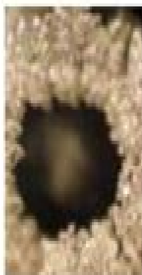
The word Spirit