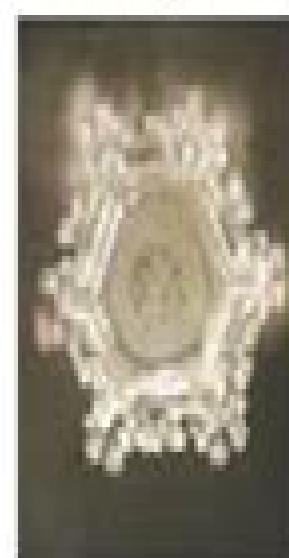
Shown a photo of dolphins