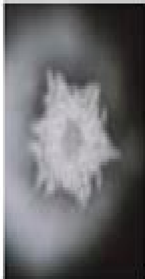
The word Peace