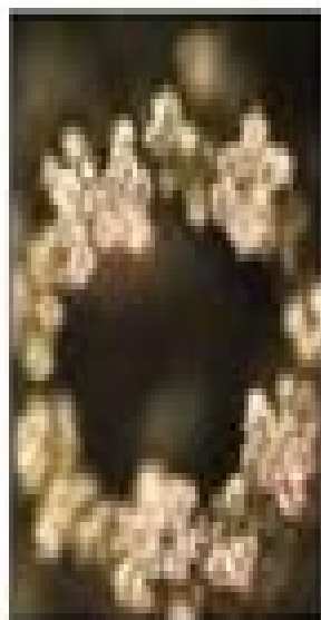
The word Angel