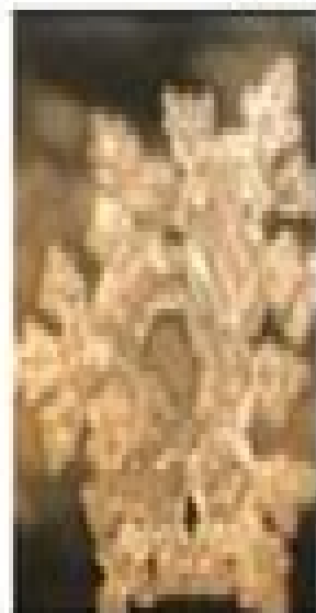
Air on a G string by Bach