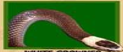
WHITE CROWNED SNAKE