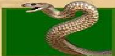
EASTERN BROWN SNAKE