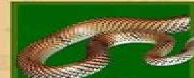
LESSER BLACK WHIP SNAKE