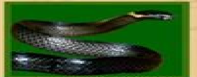
SOUTHERN DWARF CROWNED SNAKE