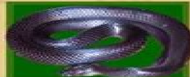
SMALL EYED SNAKE