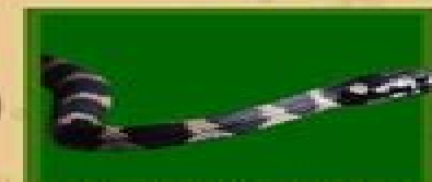
STEPHENS BANDED SNAKE