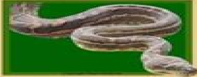
COASTAL CARPET PYTHON