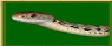
ROUGH SCALED SNAKE