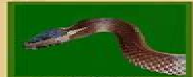
GOLDEN CROWNED SNAKE