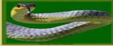
COMMON TREE SNAKE