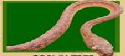
BROWN TREE SNAKE