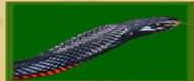
RED BELLIED BLACK SNAKE