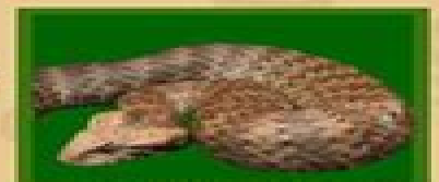
COMMON DEATH ADDER