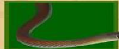
YELLOW FACED WHIP SNAKE